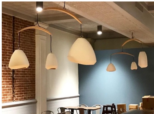
Balance Light 3-Light Mobile, First Generation Design for Balance Restaurant, Springboard Design Architects