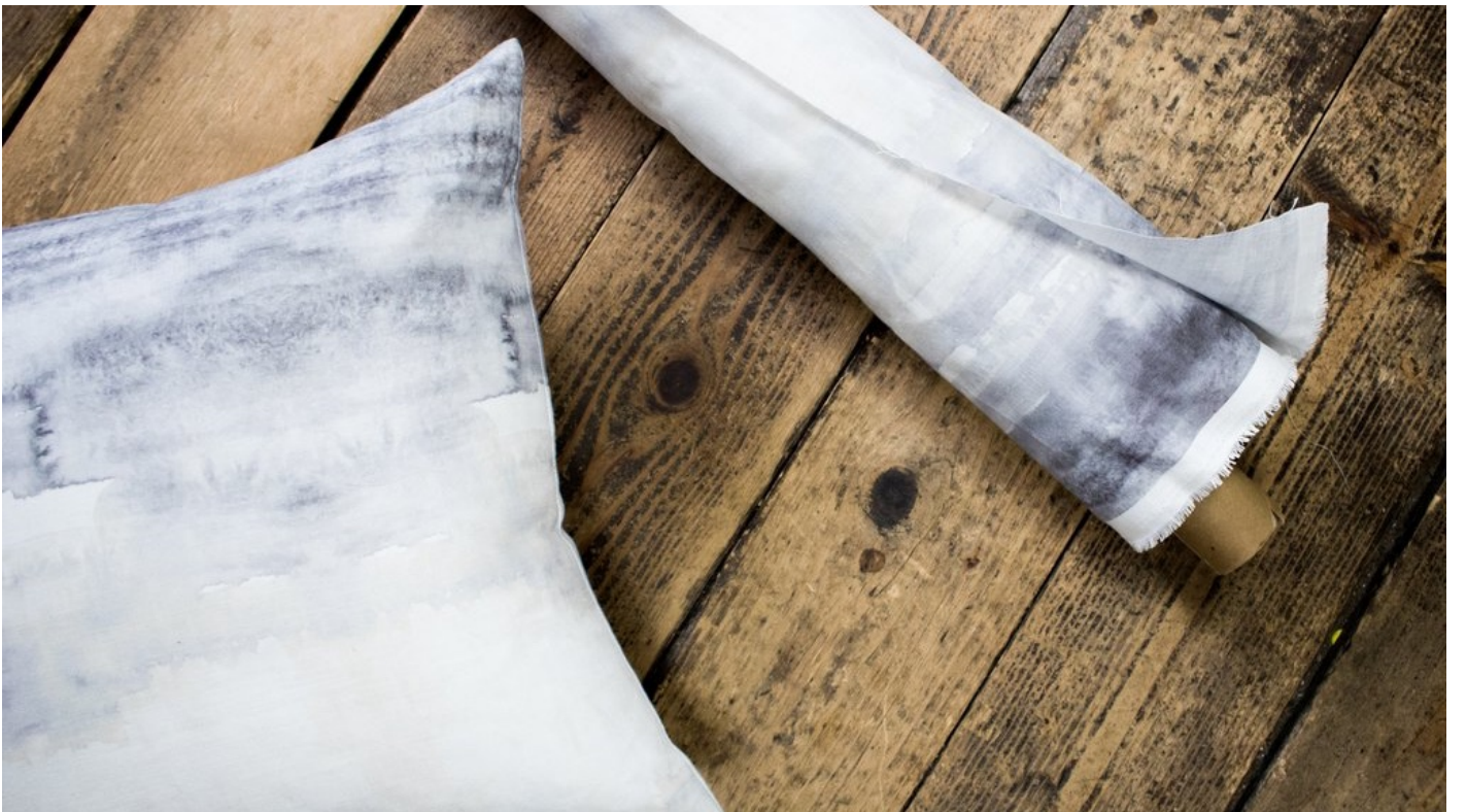
Bruges Fabric, Smoke