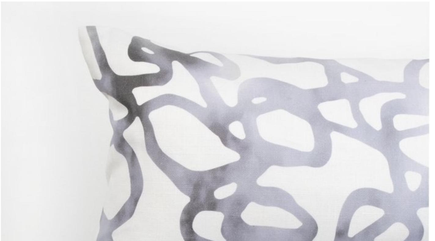
Pompeii Fabric, Smoke