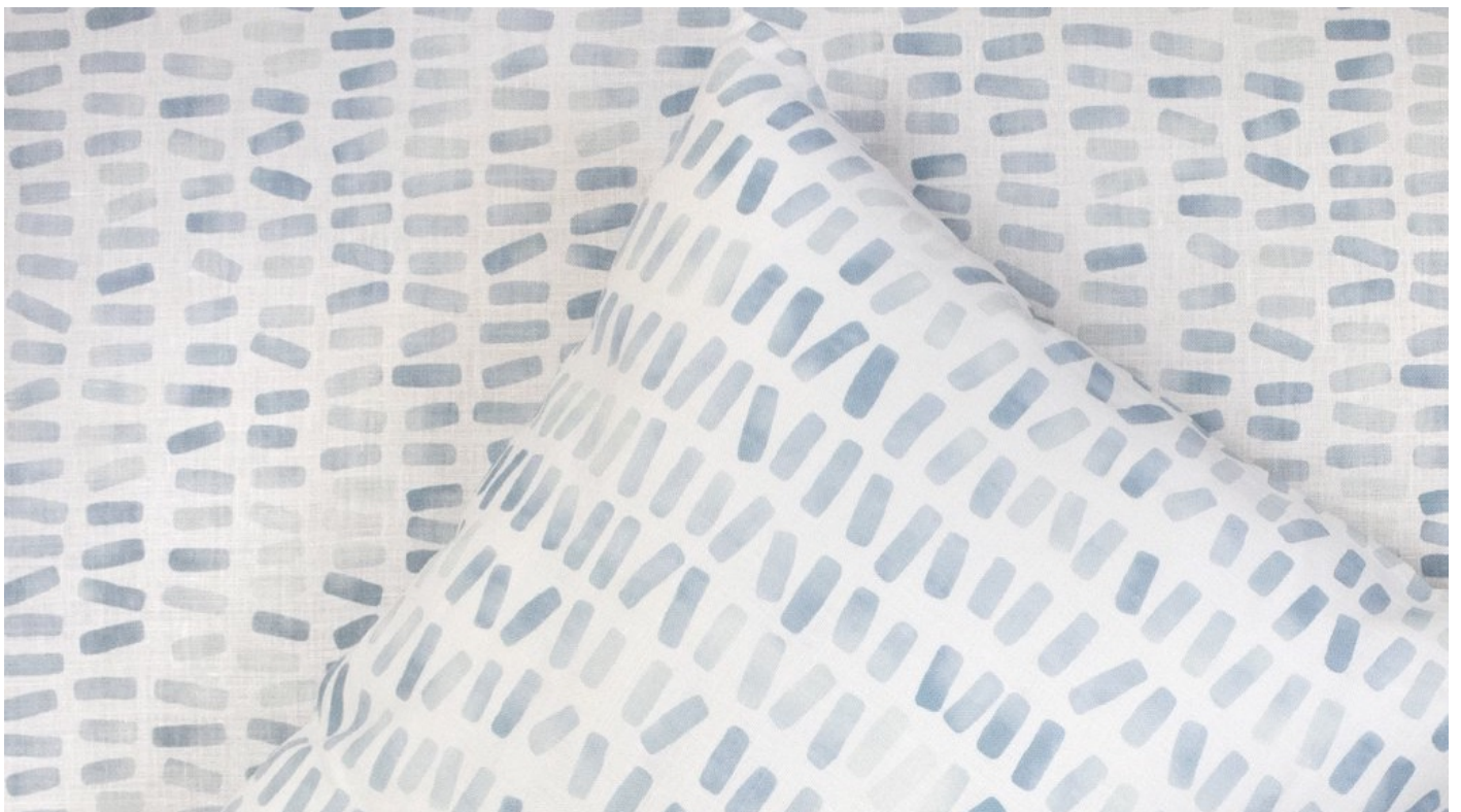
Riga Fabric, Marine