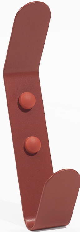
Color Pops Double Wall Hook in Terracotta with coordinating Snap Caps

Designed to mix and match, Safran Everyday's Color Pops Wall Hooks boast whimsical, modern shapes and colors. The Double Wall Hook offers durable and eye-catching storage solutions for office and home organization.