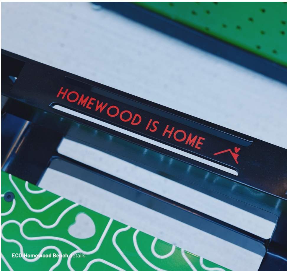
ECO:Homewood Bench details.

This durable outdoor bench is available standard for projects in Pittsburgh's Homewood neighborhood or is available customized to suit specific site and community requirements.