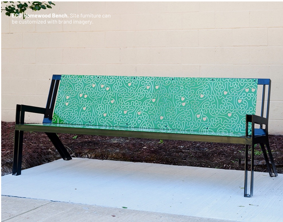
ECO:Homewood Bench. Site furniture can be customized with brand imagery.

ECO:Homewood Site Furniture feature unique community-driven designs. Selected through a community-led process, Reggie Raye of TOMO skillfully blended The Homewood Experience brand elements with site furnishings manufactured by Technique AP —a fabricator of architectural metal products and signage based in Wilksburg, PA.